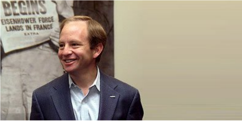
Financier, private equity investor, and “Car Czar” at the Treasury Department, Steven Rattner.

When a company goes bankrupt, everyone takes a hit: fair or not, workers lose some contract wages, stockholders get wiped out and creditors get fragments of what’s left. That’s the law. What workers don’t lose are their pensions (including old-age health funds) already taken from their wages and held in their name. But not this time.