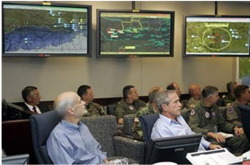
Bush and DHS secretary Chertoff at Northcom headquarters, Peterson Air Force Base, Colorado Springs, during Hurricane Rita.

The Associated Press is reporting Hawaii governor Linda Lingle as saying the World Health Organization is considering raising the pandemic alert level to phase 6, the highest level indicating a global outbreak of the swine flu. Lingle said she discussed the alert level with federal and state health officials on Friday.